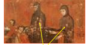
"Golden Circle" obligatory badge