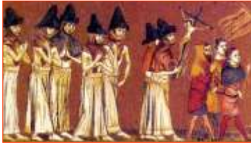
Flagellanti: Self-inflicted "penance" for our sins!