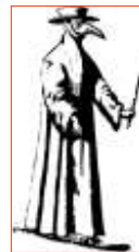
A Doctor's Robe