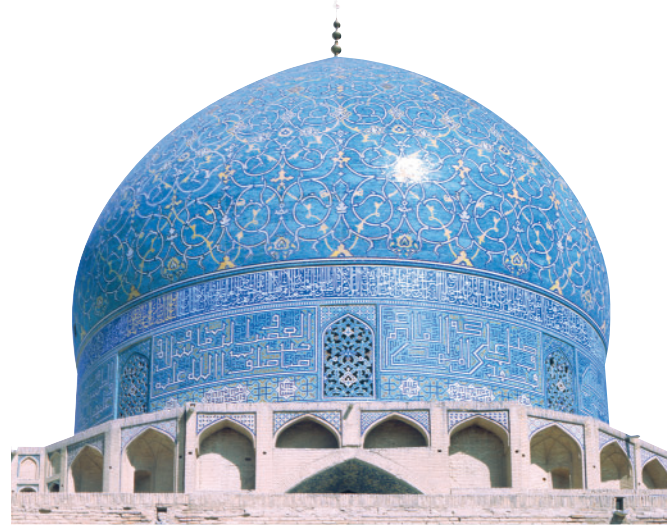
▲ The Masjid-e-Imam mosque in Esfahan is a beautiful example of the flowering of the arts in the Safavid Empire.

Carpets The most important result of Western influence on the Safavids, however, may have been the demand for Persian carpets. This demand helped change carpet weaving from a local craft to a national industry. In the beginning, the carpets reflected traditional Persian themes. As the empire became more culturally blended, the designs incorporated new themes. In the 16th century, Shah Abbas sent artists to Italy to study under the Renaissance artist Raphael. Rugs then began to reflect European designs. C