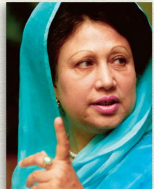
Chandrika Bandaranaike Kumaratunga