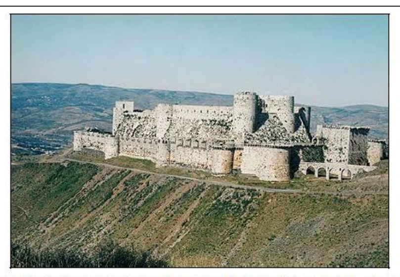
Fortress of the Knights Hospitallers [Catholic military/religious order], Syria, mid-12c