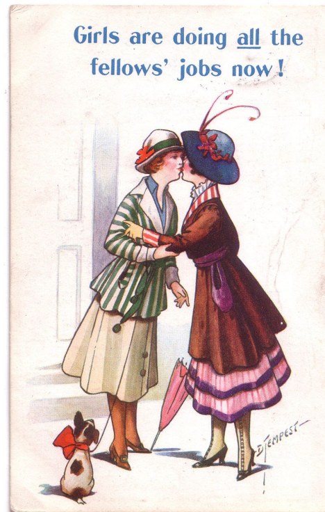
Anti-Suffragette Cartoon, 1918