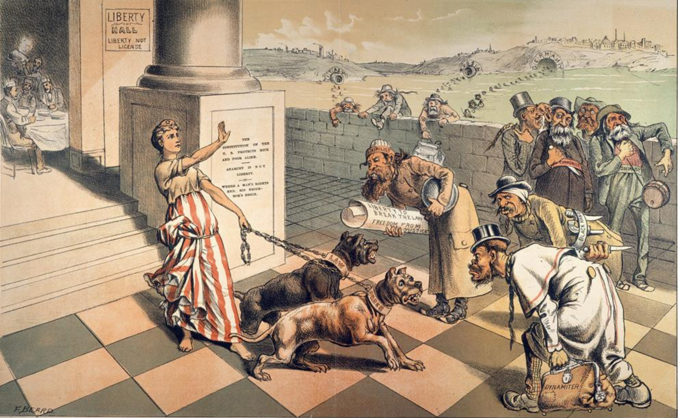
Columbia's Unwelcome Guests 1885