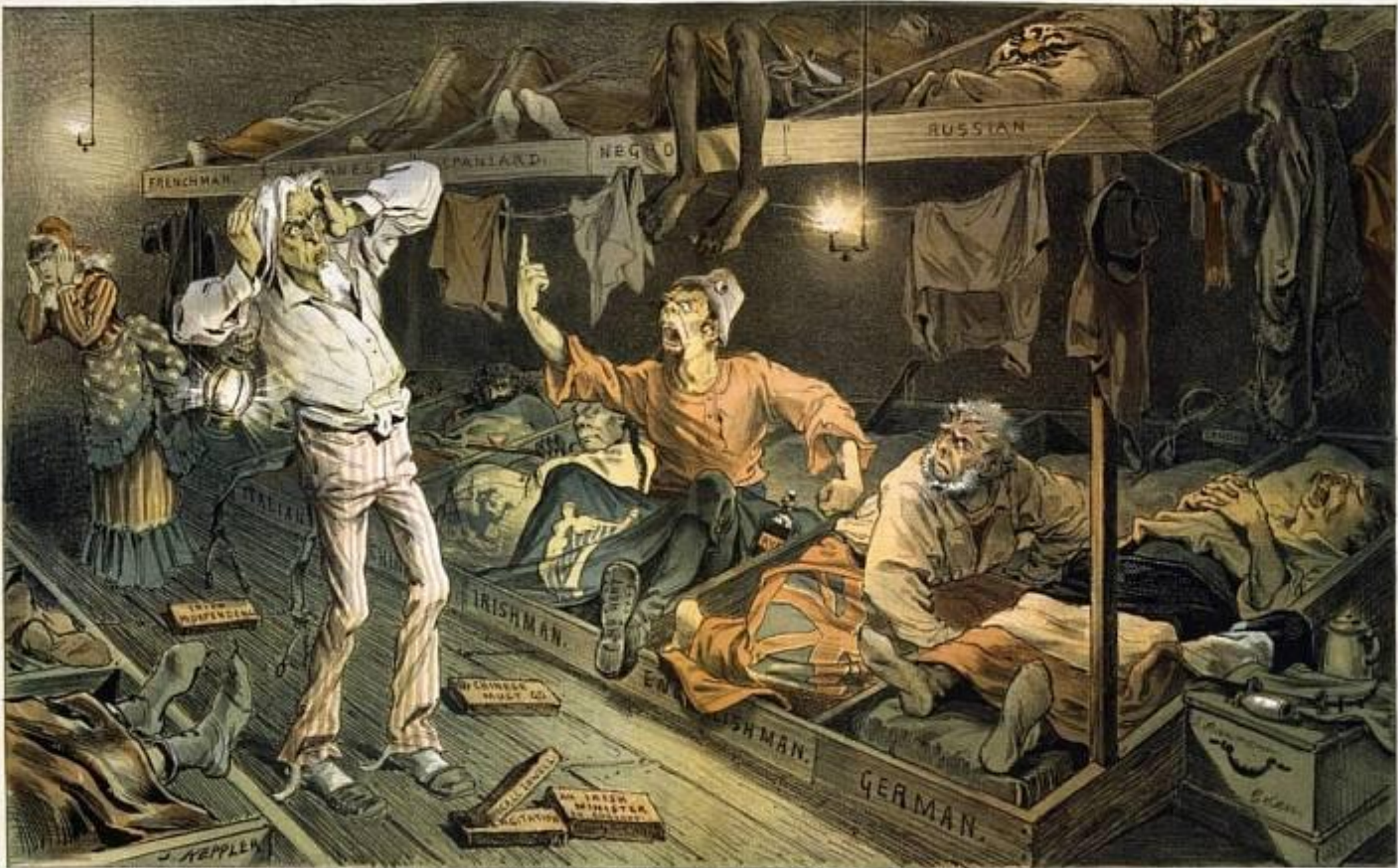
UNCLE SAM'S LODGING-HOUSE.

Uncle Sam—"Look here, you, everybody who is here and provable, and you're all the time skibbling up a new!"