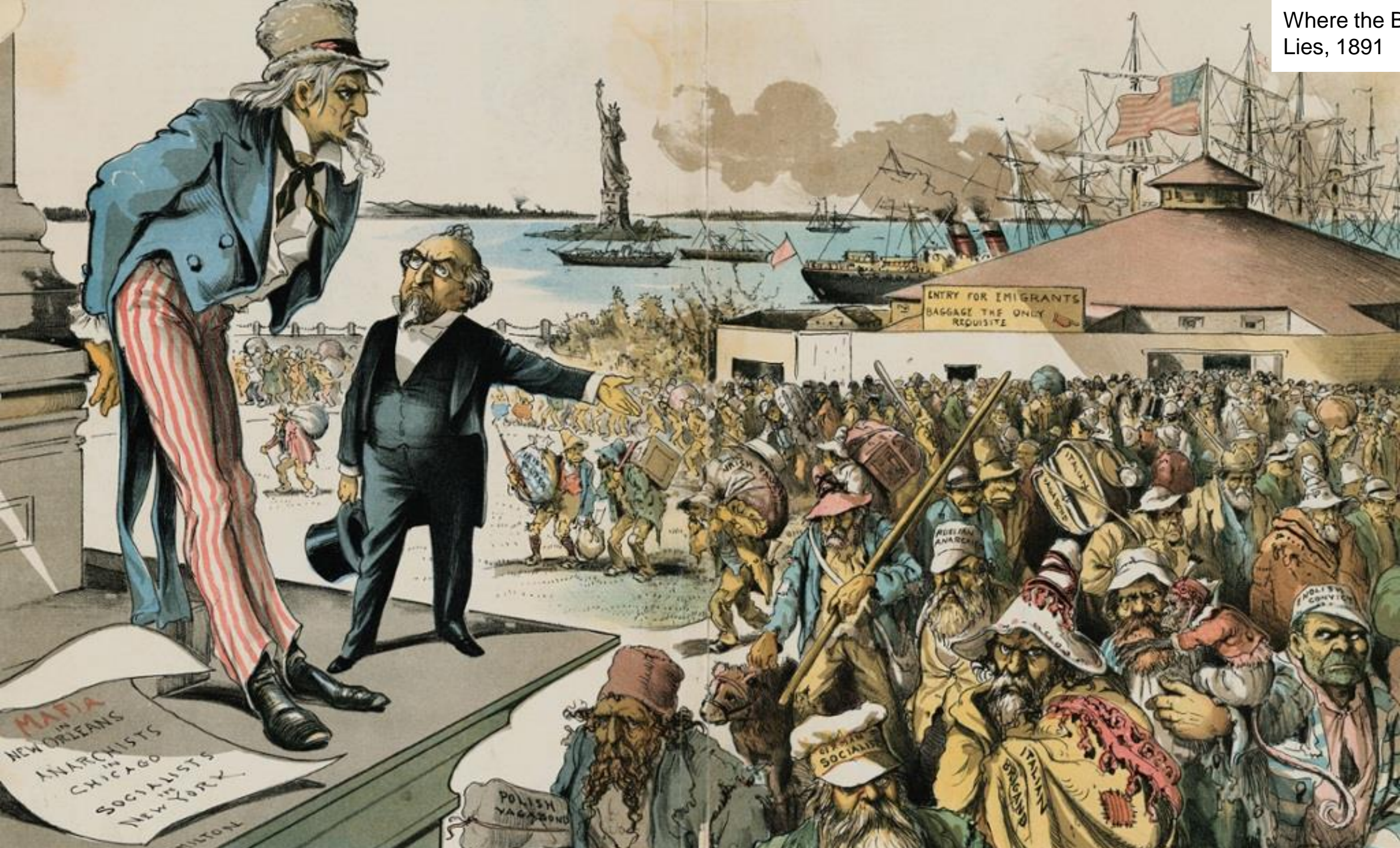
Where the Blame Lies, 1891