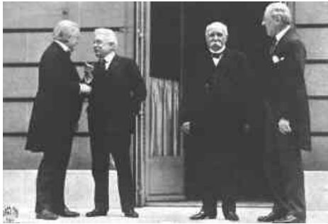
The Big Four at Versailles in 1919